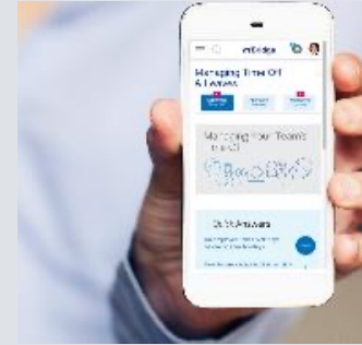
Personalized Business Services