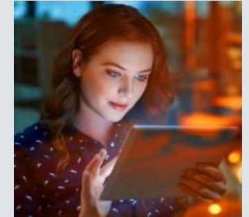
Remote & Front-line Worker Experiences