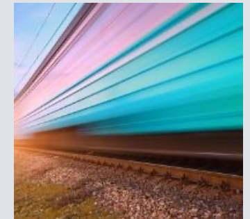
Enabling Leaders to succeed in driving new Value Creation