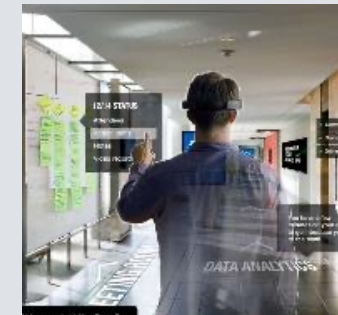
Onboarding, Engaging & Retaining Talent