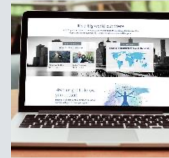
Culture In Action