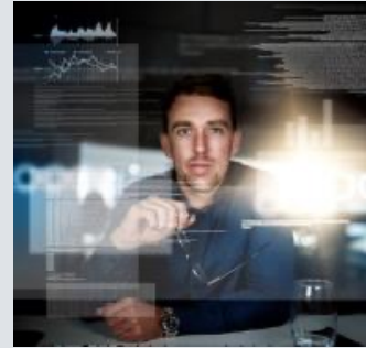
Integrated Data and Analytic Platform

and the needs of augmented workers in new digital ways of working