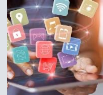
Innovation as a Capability