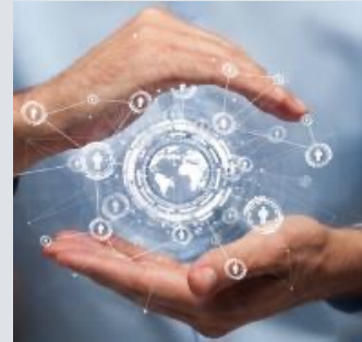
Connected Business Ecosystem