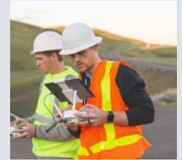
Human-machine Work Design