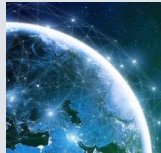
ESG & Purpose Driven Agendas